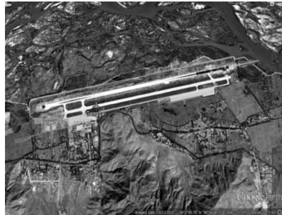
Gongga (Lhasa International)